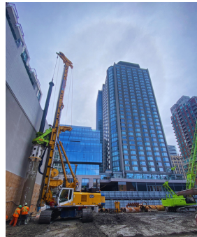
(Figure 2): Drill Rig Activity.