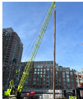
(Figure 3): Drill Rig Activity.