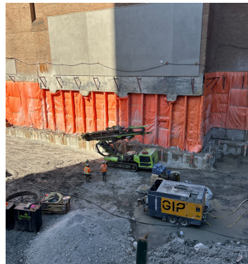
(Figure 2): Tieback drilling along the north side.

In the first half of March, tieback drilling, stressing, and post-grouting will take place on site. A steel staging platform will also be added on the west side of the site. From mid-to-late March, bulk excavation and dewatering work will continue across the site. By month-end, the site hoarding along Avenue Road will be reconfigured for the next phase of the project.