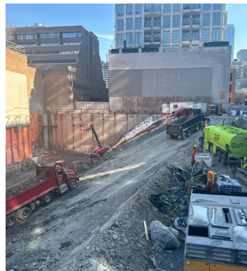
(Figure 3): Trucks hauling excavated material away, view of the east side.