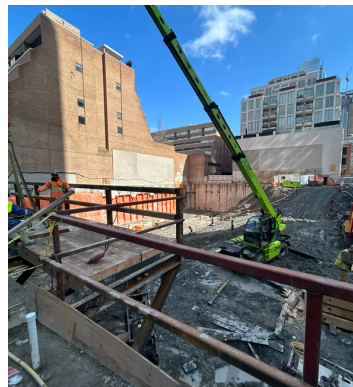
(Figure 3): Preparation for the steel staging platform on the west side of site.