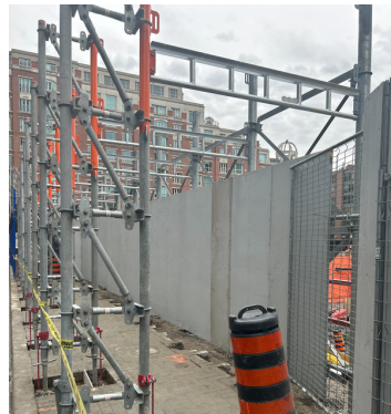
(Figure 2): Overhead structure installation along Yorkville Avenue.

Throughout April, the support structure to accommodate overhead site trailers will be fully installed along Yorkville Avenue. This will be followed by the re-installation of hoarding. Bulk excavation activities will continue on site throughout the month. To facilitate future work, a steel staging platform will be installed along the west side of site by month-end.