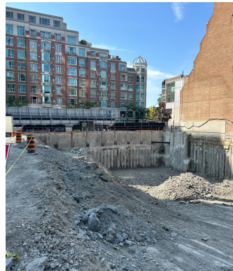
(Figure 2): Tieback installation and preparations for shoring drilling in NW corner.