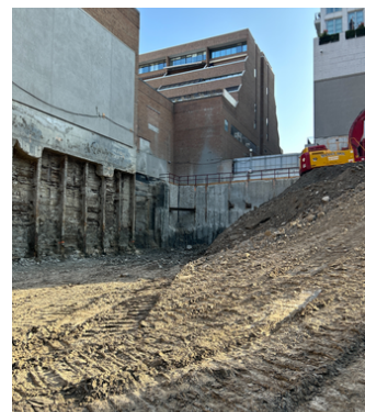
(Figure 3): Site progress of NE corner.