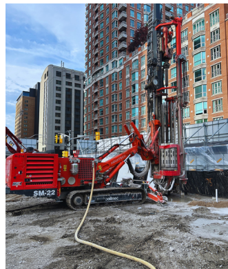
(Figure 2): Dewatering drill activity in the west corner of site.