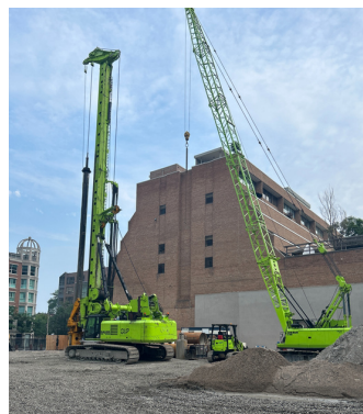
(Figure 3): Shoring drill activity.