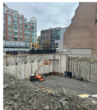
(Figure 3): Site progress of NW corner.