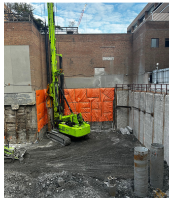
(Figure 2): Shoring caisson drilling progress, view of NE corner.