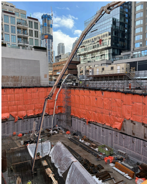
(Figure 2): View of SE corner during the first concrete pour.

Multiple concrete pours are scheduled throughout the month, including the second pour of the raft slab, located by the crane base. Concurrently, waterproofing installation will continue along the site perimeter and steel continues to be placed across the site.