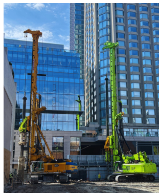
(Figure 2): Drill rig one and two working simultaneously.

Installation of shoring piles along the South, West and Northwest corner of the site perimeter.