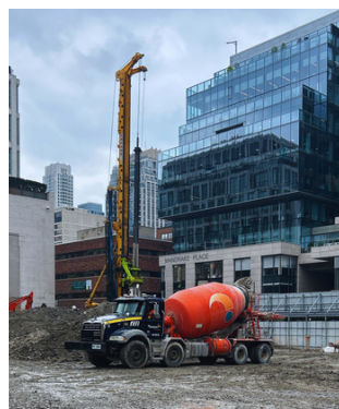
(Figure 3): Concrete delivery.