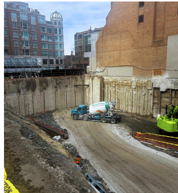
(Figure 2): Site progress of NW corner, view of a concrete truck.

The drilling of shoring caisson piles is scheduled to be completed in mid-December. Once complete, the drill will be demobilized. The installation of dewatering components will continue at various locations on site. Towards the end of the month, bulk excavation will commence on the south side, to the level of the first row of tiebacks.