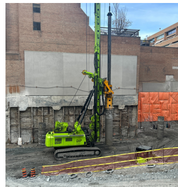
(Figure 3): View of the shoring drill working across the north elevation.