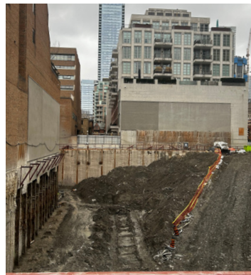
(Figure 3): Excavation progress, view of east side.