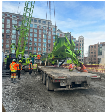
(Figure 2): Demobilization of the shoring drill rig.

The shoring drill will be de-mobilized during the first week of January. Bulk excavation on the south-west side, to the level of the first row of tiebacks is scheduled to occur during the second week of the month, followed by tieback installation and stressing by the fourth week of the month. The installation of dewatering components (drilling and connecting of pipes) continues along the north elevation throughout the month.