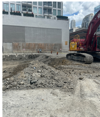
(Figure 2): Preparations underway to facilitate Phase 2 of shoring drilling on north elevation.