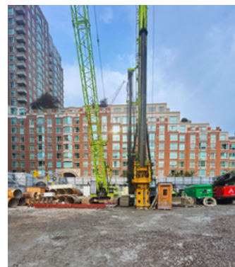
(Figure 3): All equipment and material staged in the southwest corner.