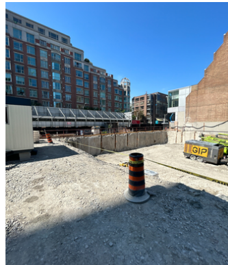
(Figure 2): Site progress, preparations for Phase 2 of shoring drilling in NW corner.