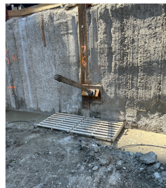
(Figure 3): Conducting performance test on tiebacks on the west wall.