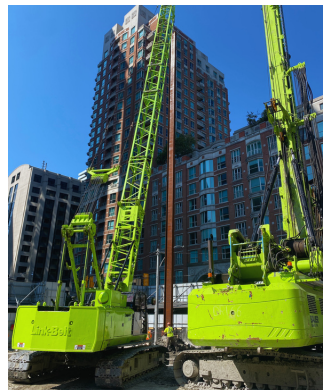
(Figure 2): Shoring drill rig #1 and #2 working simultaneously.