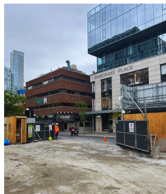
(Figure 3): Gate #2 being used for entry and exit on-site.