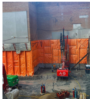
(Figure 3): Dewatering drill progress on north side.