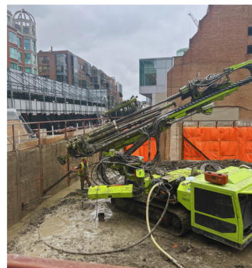
(Figure 2): Tieback drill preparation on west side.

Throughout February, bulk excavation will continue at various locations on site. During the start of the month, the installation of dewatering components continues along the north side of the site. During the second and third weeks of the month, tieback drilling, stressing and post-grouting will take place on the south and west sides of the site. Towards the end of February, installation of the drive platform will occur on the west side of the site.